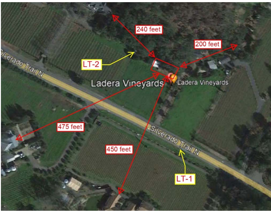
Figure 2: Site Plan Showing Measurement Locations (in yellow) and Nearest Adjacent Residences (in red)