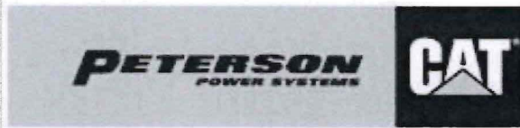
EXHIBIT A SCOPE OF SERVICES