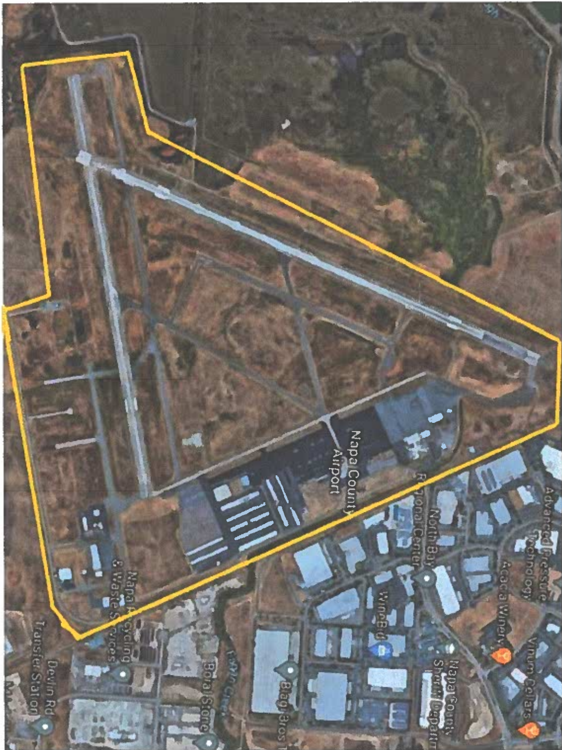
MAP OF NAPA COUNTY AIRPORT