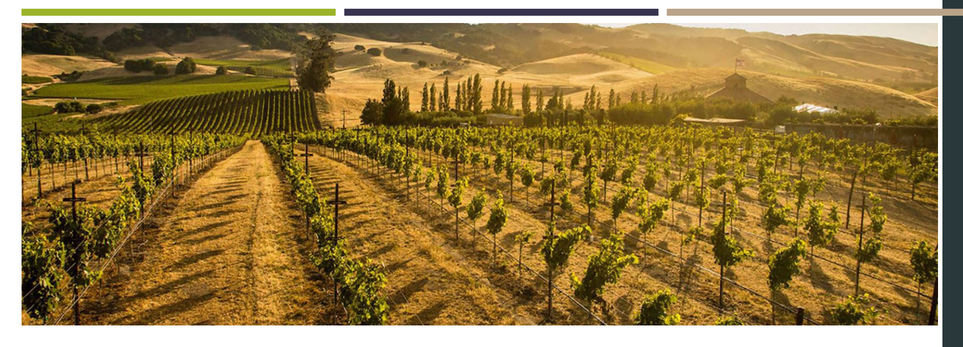
Applicant, Appellant, & Public Comment