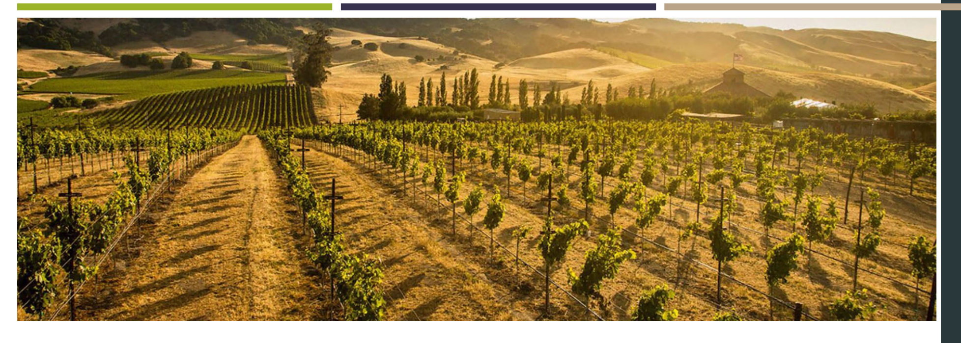
Location & Land Use Overview