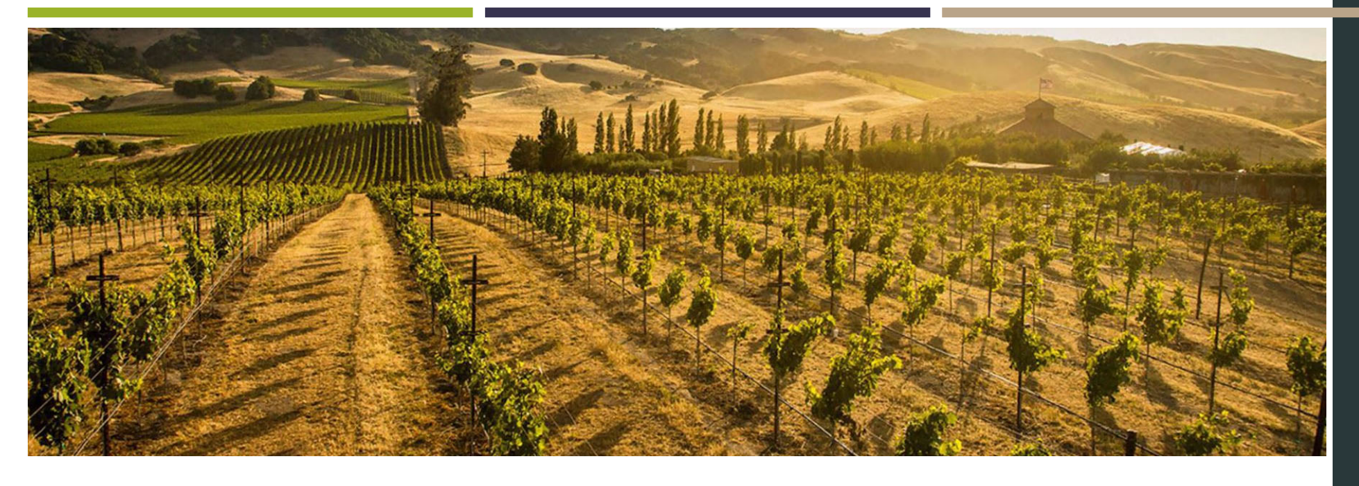
Timeline & Project Details