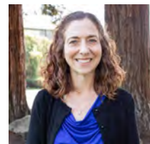
Tracy Cleveland Agriculture Commissioner