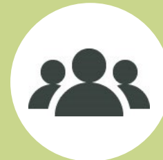
RACIAL EQUITY & LGBTQ INCLUSION