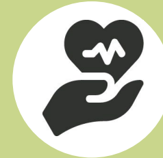
ACCESS TO HEALTH SERVICES