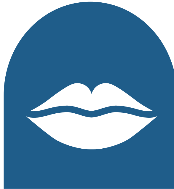
Limited English Proficiency