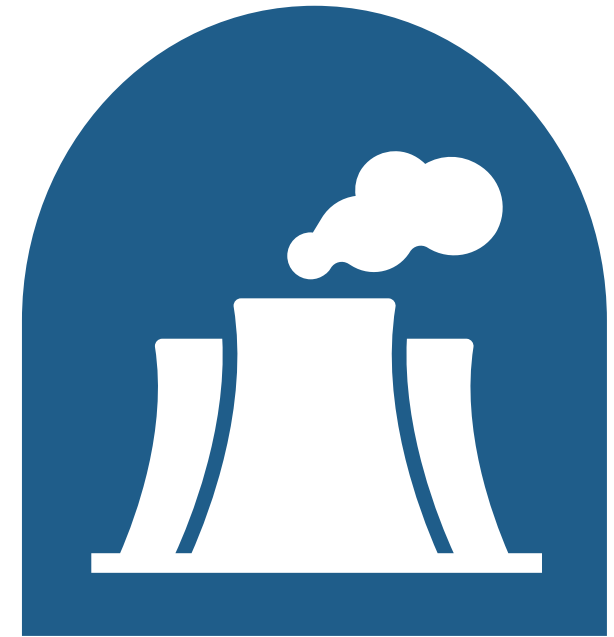
Located in High Pollution Zones