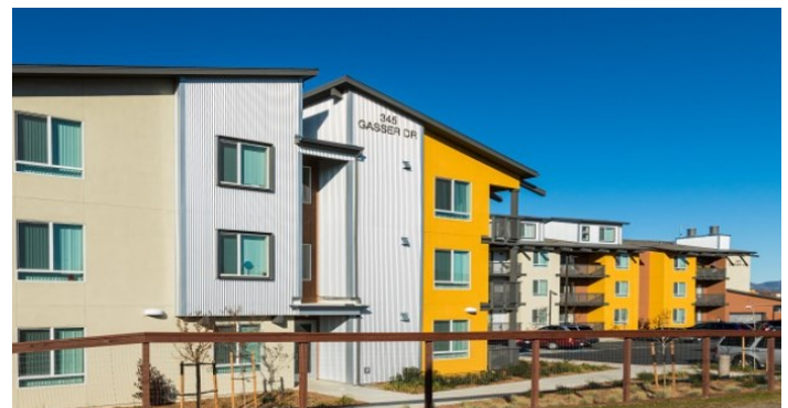
Stoddard West Apartments