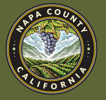
A Tradition of Stewardship A Commitment to Service